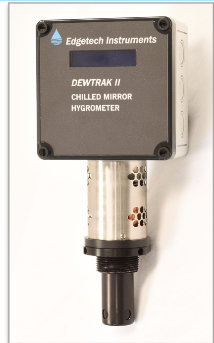
DewTrak II Hygrometer With the DX Sensor

The DewTrak II is available with either the Edgetech Instruments D Sensor or the higher performance DX sensor. Either may be mounted directly to the hygrometer's chassis for ambient air monitoring or they may be mounted remotely for insertion into glove boxes, HVAC ducts, environmental test chambers, circulation pipes, refrigerated storage rooms, engine test chambers and many other environments.